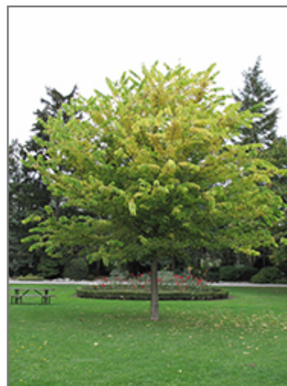
Common Hackberry in fall