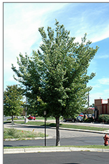
Common Hackberry