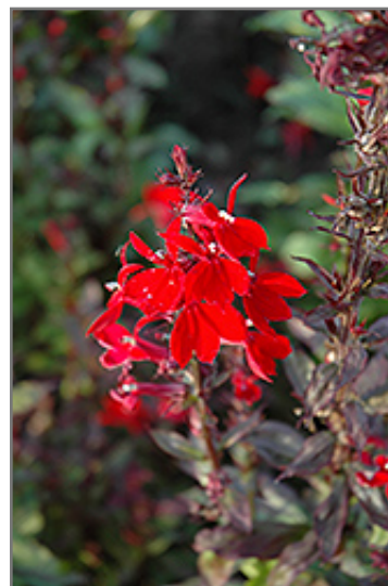
Queen Victoria Lobelia flowers