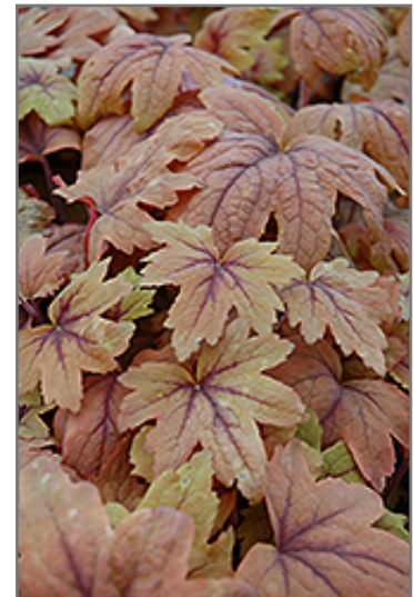
Sweet Tea Foamy Bells foliage