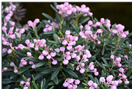
Blue Ice Bog Rosemary flowers