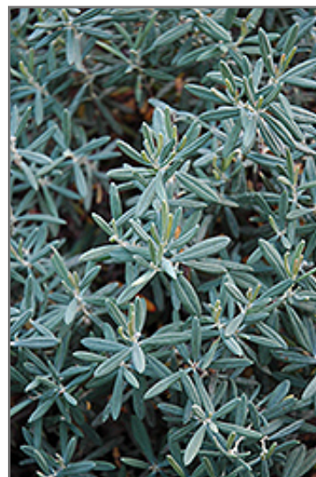
Blue Ice Bog Rosemary foliage

This shrub does best in full sun to partial shade. It prefers to grow in moist to wet soil, and will even tolerate some standing water. It is not particular as to soil type, but has a definite preference for acidic soils, and is subject to chlorosis (yellowing) of the foliage in alkaline soils. It is somewhat tolerant of urban pollution, and will benefit from being planted in a relatively sheltered location. Consider applying a thick mulch around the root zone in winter to protect it in exposed locations or colder microclimates. This is a selection of a native North American species.