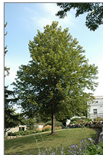
Celebration Maple