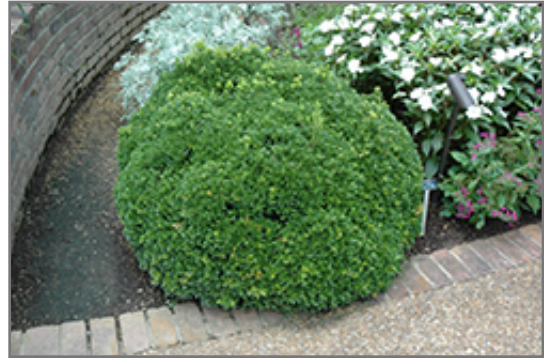
Compact Korean Boxwood

Compact Korean Boxwood is recommended for the following landscape applications;