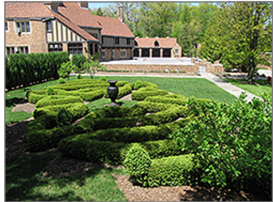
Compact Korean Boxwood

Compact Korean Boxwood will grow to be about 12 inches tall at maturity, with a spread of 12 inches. It tends to fill out right to the ground and therefore doesn't necessarily require facer plants in front. It grows at a slow rate, and under ideal conditions can be expected to live for approximately 30 years.