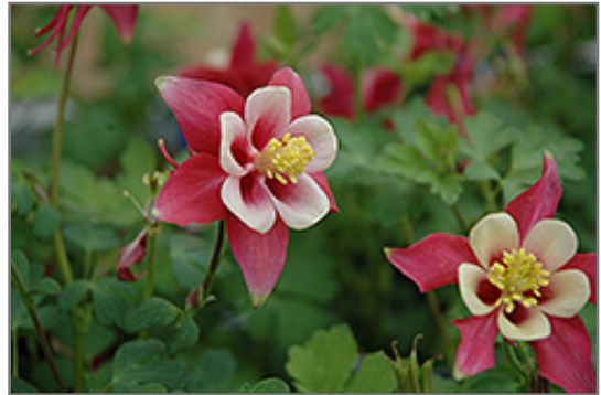
Crimson Star Columbine flowers