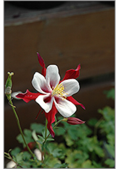
Crimson Star Columbine flowers

Crimson Star Columbine is recommended for the following landscape applications;