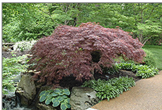
Red Select Japanese Maple