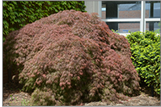
Red Select Japanese Maple

This tree does best in full sun to partial shade. You may want to keep it away from hot, dry locations that receive direct afternoon sun or which get reflected sunlight, such as against the south side of a white wall. It prefers to grow in average to moist conditions, and shouldn't be allowed to dry out. It is not particular as to soil pH, but grows best in rich soils. It is somewhat tolerant of urban pollution, and will benefit from being planted in a relatively sheltered location. Consider applying a thick mulch around the root zone in winter to protect it in exposed locations or colder microclimates. This is a selected variety of a species not originally from North America.