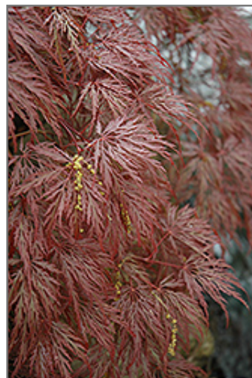
Inaba Shidare Cutleaf Japanese Maple foliage

Inaba Shidare Cutleaf Japanese Maple is recommended for the following landscape applications;