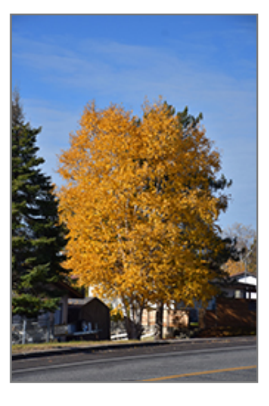
Clump Paper Birch in fall