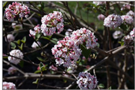
Koreanspice Viburnum flowers