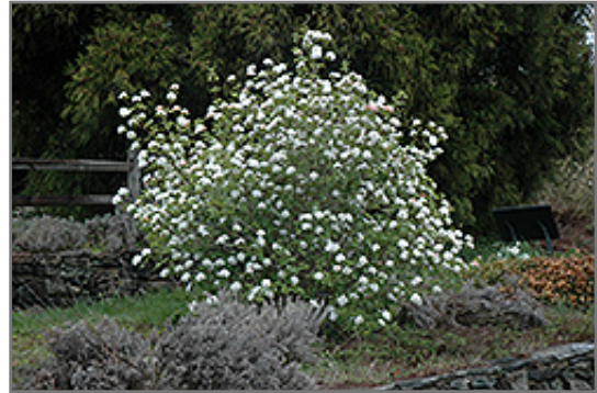
Koreanspice Viburnum in bloom

This is a relatively low maintenance shrub, and should only be pruned after flowering to avoid removing any of the current season's flowers. It is a good choice for attracting birds to your yard, but is not particularly attractive to deer who tend to leave it alone in favor of tastier treats. It has no significant negative characteristics.