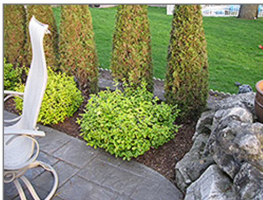
Country Gold Wintercreeper