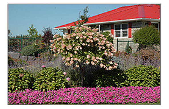
Tree Form Pee Gee Hydrangea in bloom

Tree Form Pee Gee Hydrangea features bold conical white flowers at the ends of the branches from mid summer to late fall. The flowers are excellent for cutting. It has green deciduous foliage. The pointy leaves do not develop any appreciable fall colour.