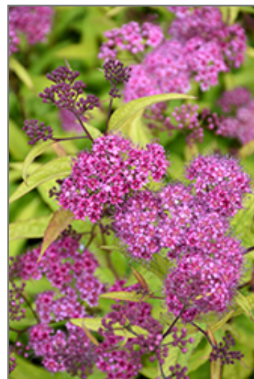
Flaming Mound Spirea flowers

Flaming Mound Spirea is recommended for the following landscape applications;