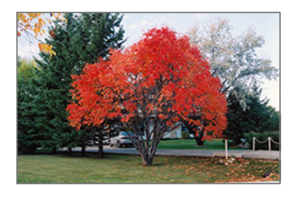
European Mountain Ash in fall

European Mountain Ash is recommended for the following landscape applications;