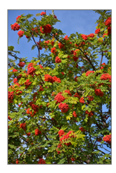
European Mountain Ash fruit