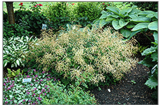
Misty Lace Goatsbeard in bloom