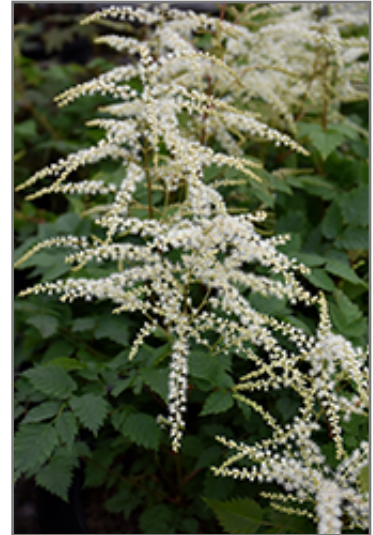
Misty Lace Goatsbeard flowers

Misty Lace Goatsbeard is recommended for the following landscape applications;