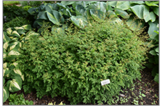
Misty Lace Goatsbeard

Misty Lace Goatsbeard will grow to be about 24 inches tall at maturity, with a spread of 24 inches. Its foliage tends to remain dense right to the ground, not requiring facer plants in front. It grows at a medium rate, and under ideal conditions can be expected to live for approximately 12 years. As an herbaceous perennial, this plant will usually die back to the crown each winter, and will regrow from the base each spring. Be careful not to disturb the crown in late winter when it may not be readily seen!