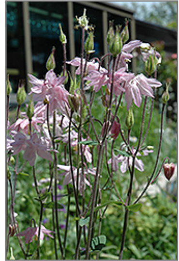
Apple Blossom Columbine flowers