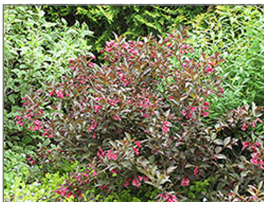
Midnight Wine Weigela in bloom