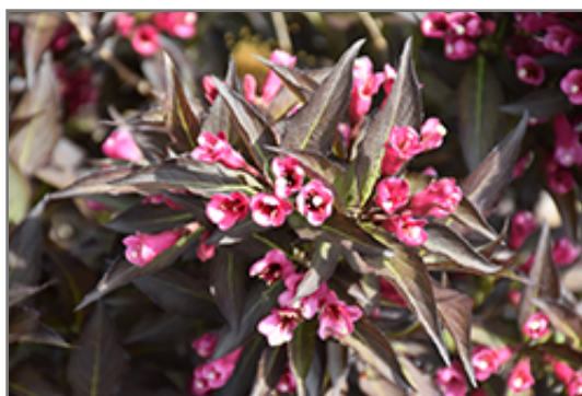
Midnight Wine Weigela flowers