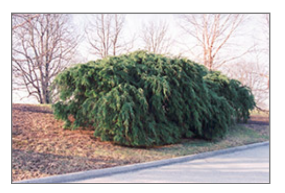
Sargent's Weeping Hemlock

This shrub will require occasional maintenance and upkeep, and is best pruned in late winter once the threat of extreme cold has passed. Gardeners should be aware of the following characteristic(s) that may warrant special consideration;