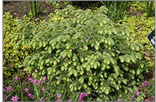
Moon Frost Hemlock

Moon Frost Hemlock is recommended for the following landscape applications;