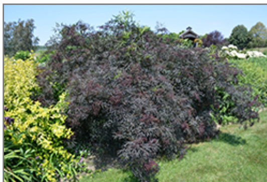
Black Lace Elder