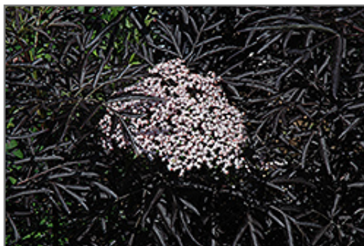
Black Lace Elder flowers