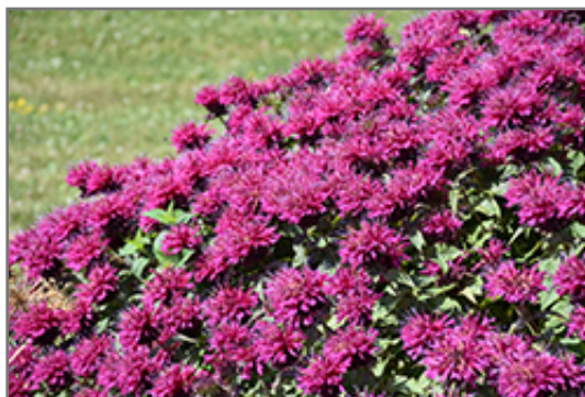
Grand Marshall Beebalm flowers

Grand Marshall Beebalm is recommended for the following landscape applications;