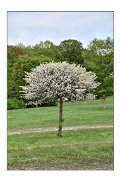
Lollipop Flowering Crab in bloom

* This is a 'special order' plant - contact store for details