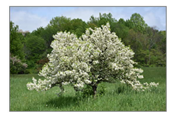
Lollipop Flowering Crab in bloom