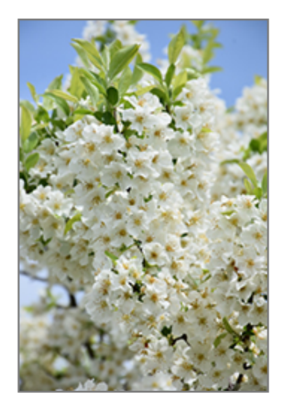
Lollipop Flowering Crab flowers