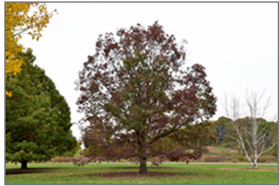
White Oak in fall

White Oak will grow to be about 90 feet tall at maturity, with a spread of 70 feet. It has a high canopy of foliage that sits well above the ground, and should not be planted underneath power lines. As it matures, the lower branches of this tree can be strategically removed to create a high enough canopy to support unobstructed human traffic underneath. It grows at a slow rate, and under ideal conditions can be expected to live to a ripe old age of 300 years or more; think of this as a heritage tree for future generations!