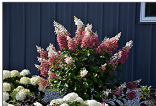
Pinky Winky Hydrangea in bloom