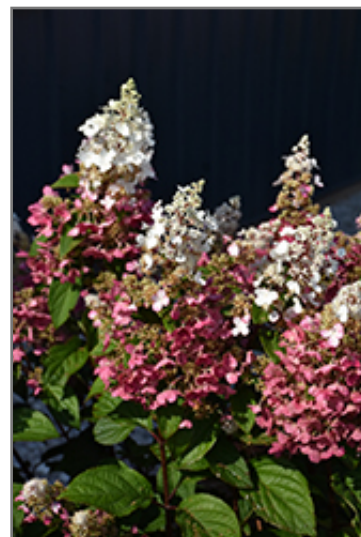
Pinky Winky Hydrangea flowers