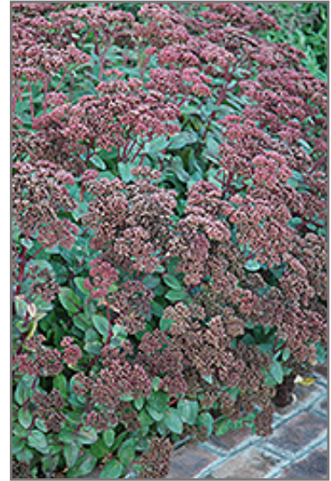
Matrona Stonecrop flowers

Matrona Stonecrop is recommended for the following landscape applications;