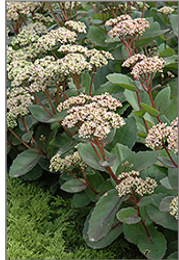
Matrona Stonecrop flowers

Matrona Stonecrop is a fine choice for the garden, but it is also a good selection for planting in outdoor pots and containers. With its upright habit of growth, it is best suited for use as a 'thriller' in the 'spiller-thriller-filler' container combination; plant it near the center of the pot, surrounded by smaller plants and those that spill over the edges. Note that when growing plants in outdoor containers and baskets, they may require more frequent waterings than they would in the yard or garden.