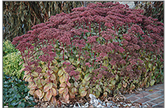
Matrona Stonecrop in fall