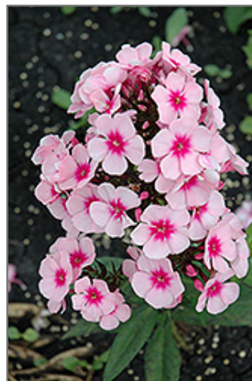
Bright Eyes Garden Phlox flowers

Bright Eyes Garden Phlox is a fine choice for the garden, but it is also a good selection for planting in outdoor pots and containers. With its upright habit of growth, it is best suited for use as a 'thriller' in the 'spiller-thriller-filler' container combination; plant it near the center of the pot, surrounded by smaller plants and those that spill over the edges. It is even sizeable enough that it can be grown alone in a suitable container. Note that when growing plants in outdoor containers and baskets, they may require more frequent waterings than they would in the yard or garden.