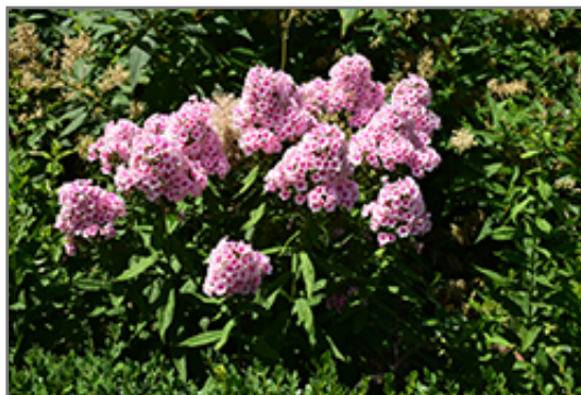
Bright Eyes Garden Phlox in bloom