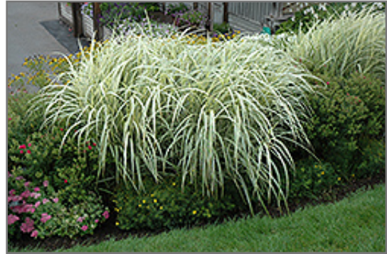
Variegated Silver Grass