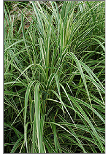
Variegated Silver Grass

This plant does best in full sun to partial shade. It prefers to grow in average to moist conditions, and shouldn't be allowed to dry out. It is not particular as to soil type or pH. It is highly tolerant of urban pollution and will even thrive in inner city environments. This is a selected variety of a species not originally from North America. It can be propagated by division; however, as a cultivated variety, be aware that it may be subject to certain restrictions or prohibitions on propagation.