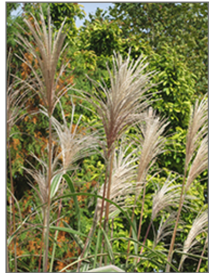
Variegated Silver Grass flowers