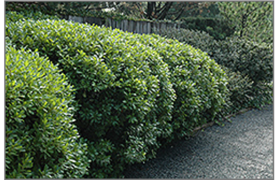
Northern Bayberry