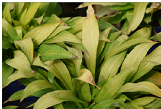
Munchkin Fire Hosta foliage