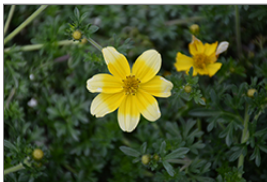
Cupcake Banana Cream Bidens flowers

Cupcake Banana Cream Bidens is recommended for the following landscape applications;