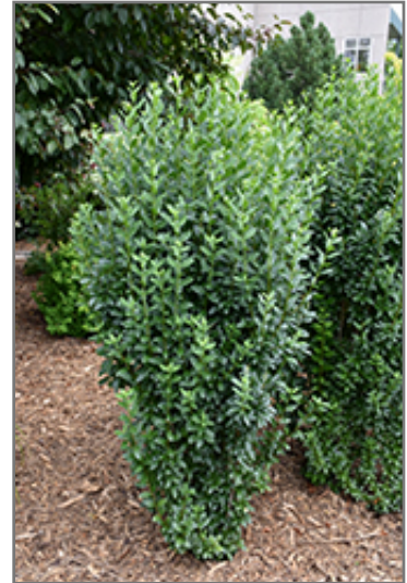
Straight Talk Privet