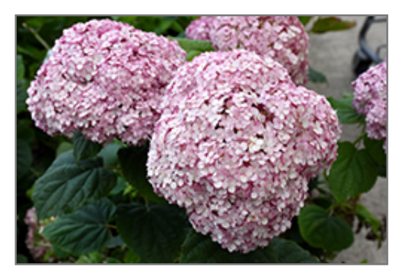
Invincibelle Spirit II Hydrangea flowers