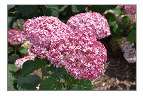
Invincibelle Spirit II Hydrangea flowers