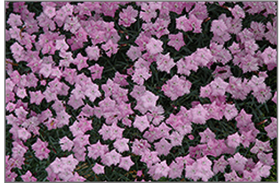
Bath's Pink Pinks in bloom

Bath's Pink Pinks is recommended for the following landscape applications;