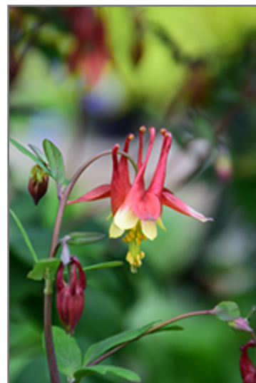
Wild Red Columbine flowers

Wild Red Columbine is recommended for the following landscape applications;