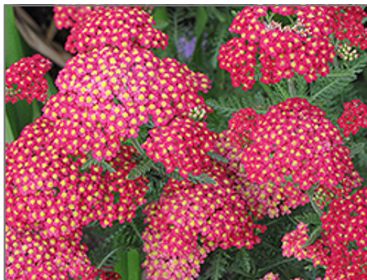
Galaxy Paprika Yarrow flowers

Galaxy Paprika Yarrow is recommended for the following landscape applications;