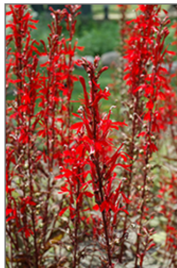
Black Truffle Cardinal Flower flowers