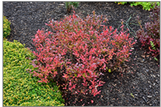
Lowbush Blueberry in fall