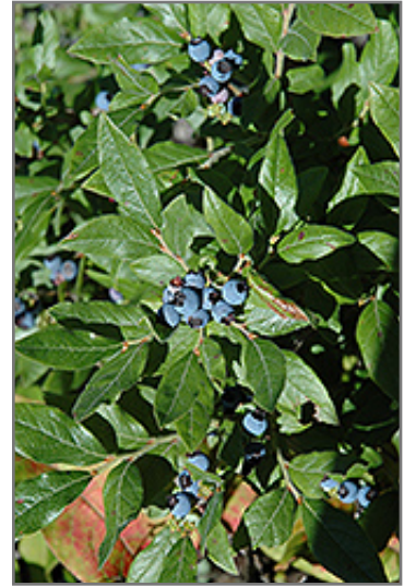
Lowbush Blueberry fruit

This is an open spreading deciduous shrub with a spreading, ground-hugging habit of growth. Its relatively fine texture sets it apart from other landscape plants with less refined foliage. This is a relatively low maintenance plant, and usually looks its best without pruning, although it will tolerate pruning. It is a good choice for attracting birds to your yard. It has no significant negative characteristics.