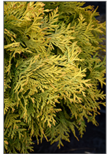
Golden Globe Arborvitae foliage