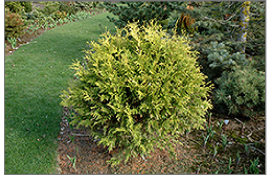
Golden Globe Arborvitae

Golden Globe Arborvitae is recommended for the following landscape applications;