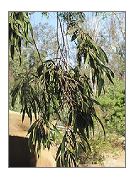
Peppermint Tree foliage

Peppermint Tree is a fine choice for the yard, but it is also a good selection for planting in outdoor pots and containers. Because of its height, it is often used as a 'thriller' in the 'spiller-thriller-filler' container combination; plant it near the center of the pot, surrounded by smaller plants and those that spill over the edges. It is even sizeable enough that it can be grown alone in a suitable container. Note that when grown in a container, it may not perform exactly as indicated on the tag - this is to be expected. Also note that when growing plants in outdoor containers and baskets, they may require more frequent waterings than they would in the yard or garden. Be aware that in our climate, this plant may be too tender to survive the winter if left outdoors in a container. Contact our experts for more information on how to protect it over the winter months.