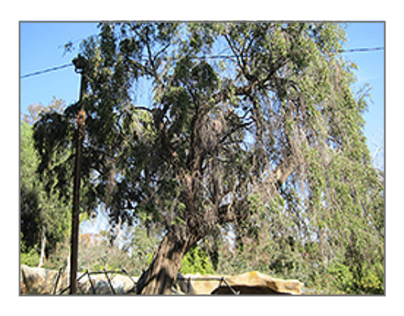
Peppermint Tree