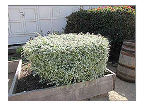
Licorice Plant