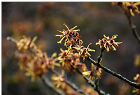
Chinese Witchhazel flowers