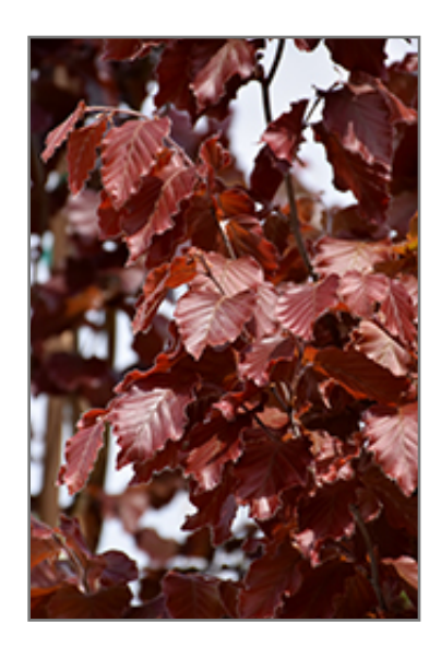
Red Obelisk Beech foliage