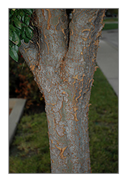
Emerald Prairie Elm bark