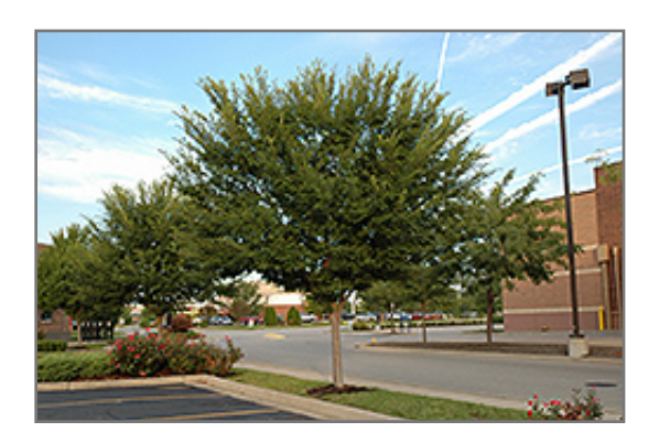
Emerald Prairie Elm

Emerald Prairie Elm is recommended for the following landscape applications;