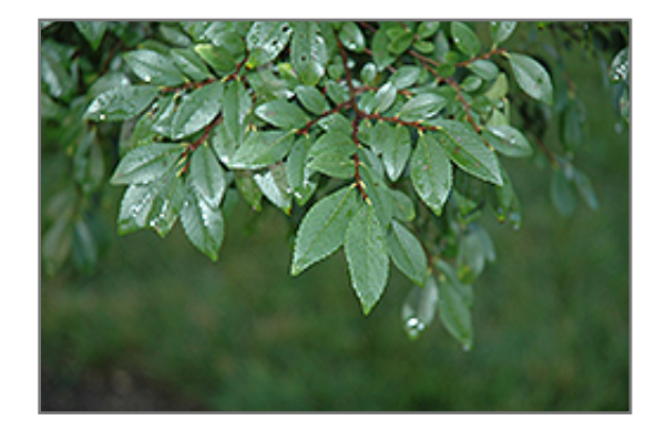
Emerald Prairie Elm foliage

This tree should only be grown in full sunlight. It is very adaptable to both dry and moist locations, and should do just fine under average home landscape conditions. It is not particular as to soil type or pH, and is able to handle environmental salt. It is highly tolerant of urban pollution and will even thrive in inner city environments. This is a selected variety of a species not originally from North America.