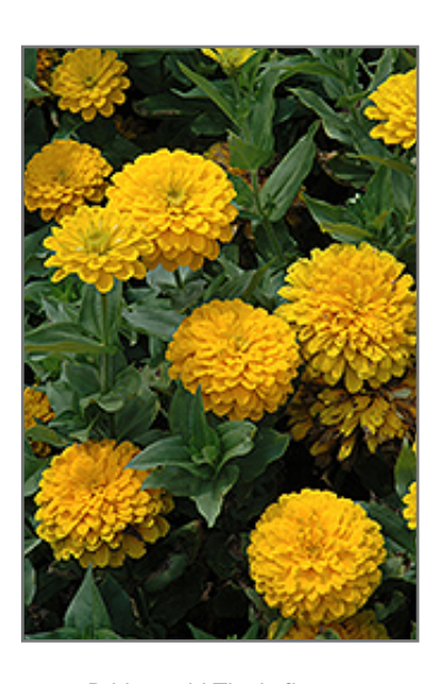
Bridesmaid Zinnia flowers

Bridesmaid Zinnia will grow to be about 16 inches tall at maturity, with a spread of 12 inches. When grown in masses or used as a bedding plant, individual plants should be spaced approximately 8 inches apart. Its foliage tends to remain dense right to the ground, not requiring facer plants in front. This fast-growing annual will normally live for one full growing season, needing replacement the following year.