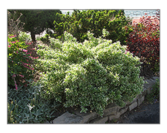
Emerald Gaiety Wintercreeper

Emerald Gaiety Wintercreeper is recommended for the following landscape applications;