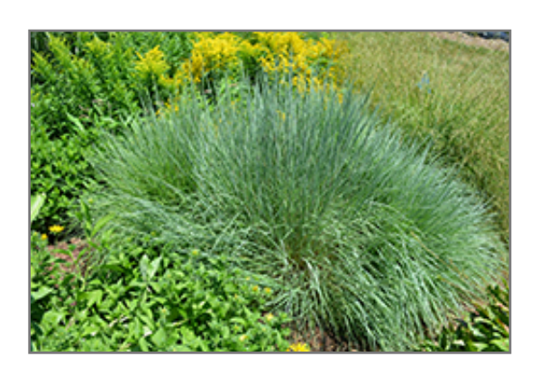
Prairie Blues Bluestem