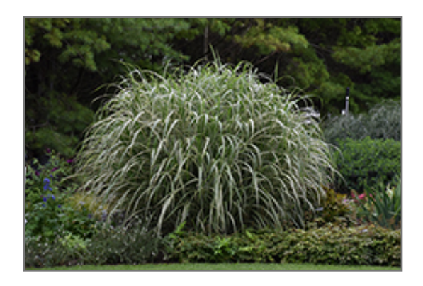
Cosmopolitan Maiden Grass

Cosmopolitan Maiden Grass is recommended for the following landscape applications;