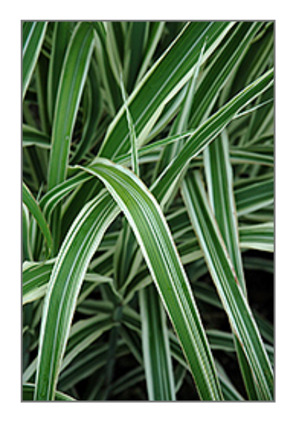
Cosmopolitan Maiden Grass foliage