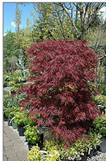
Red Dragon Japanese Maple

Red Dragon Japanese Maple is a fine choice for the yard, but it is also a good selection for planting in outdoor pots and containers. Because of its height, it is often used as a 'thriller' in the 'spiller-thriller-filler' container combination; plant it near the center of the pot, surrounded by smaller plants and those that spill over the edges. It is even sizeable enough that it can be grown alone in a suitable container. Note that when grown in a container, it may not perform exactly as indicated on the tag - this is to be expected. Also note that when growing plants in outdoor containers and baskets, they may require more frequent waterings than they would in the yard or garden. Be aware that in our climate, this plant may be too tender to survive the winter if left outdoors in a container. Contact our experts for more information on how to protect it over the winter months.