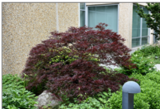
Red Dragon Japanese Maple

This is a relatively low maintenance tree, and should only be pruned in summer after the leaves have fully developed, as it may 'bleed' sap if pruned in late winter or early spring. It has no significant negative characteristics.