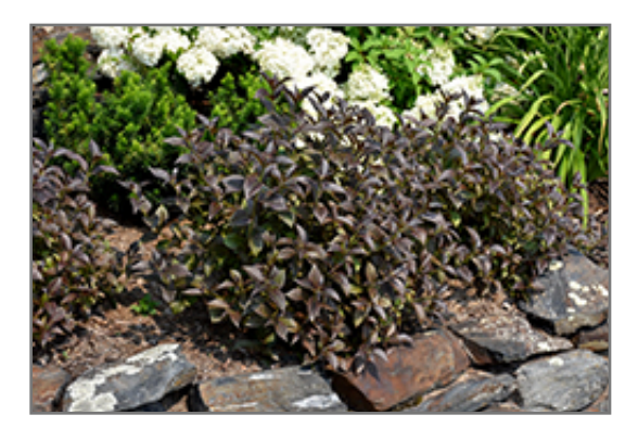
Tango Weigela

This shrub should only be grown in full sunlight. It prefers to grow in average to moist conditions, and shouldn't be allowed to dry out. It is not particular as to soil type or pH. It is highly tolerant of urban pollution and will even thrive in inner city environments. This is a selected variety of a species not originally from North America.