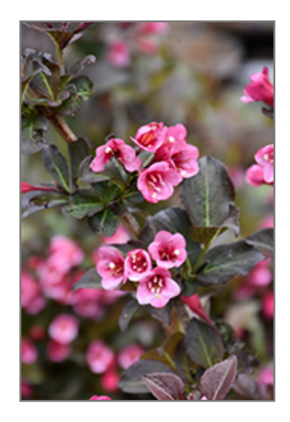
Tango Weigela flowers

Tango Weigela is recommended for the following landscape applications;